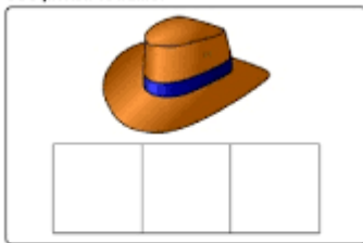
CVC phoneme frames

Frames for pupils to record the phonemes in words, each phoneme/grapheme in a separate box