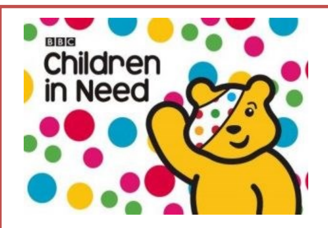
FRIDAY 17th NOVEMBER 2023

Both Oaklands Infant and Junior Schools will both be supporting Children in Need this year.