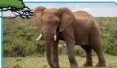
an African elephant