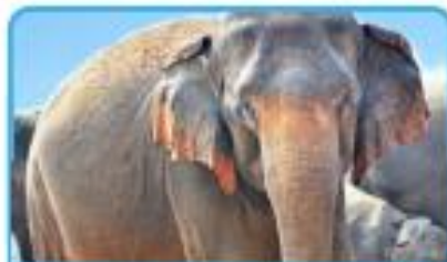
an Asian elephant