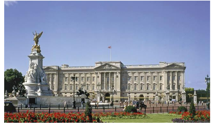
Buckingham Palace in London