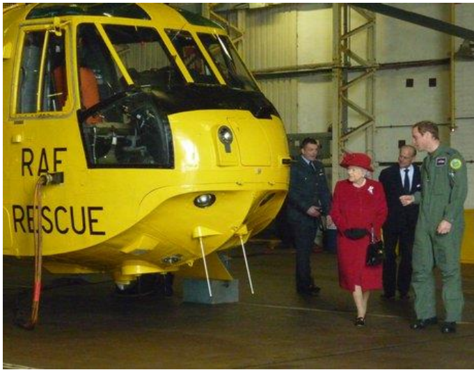
The Queen visiting RAF Valley