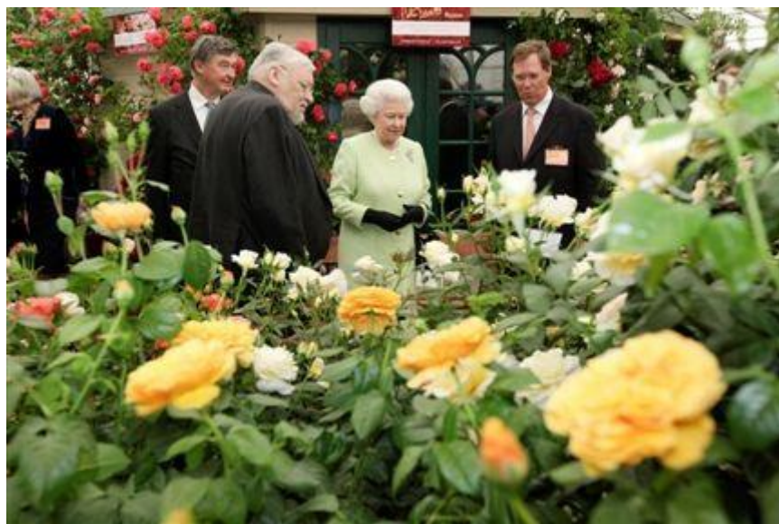
A day at the Chelsea Flower Show