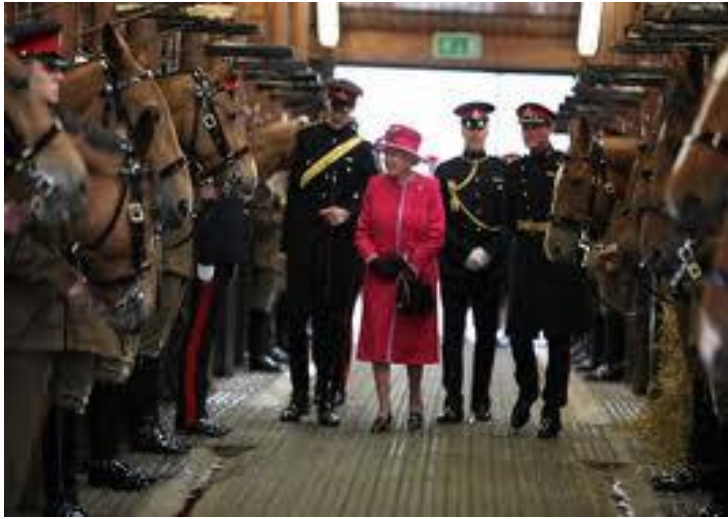
The Queen inspecting her horses