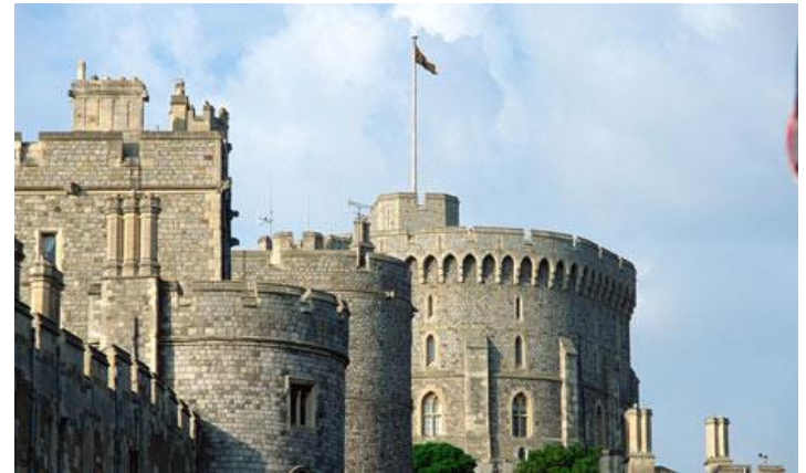
Windsor Castle near London