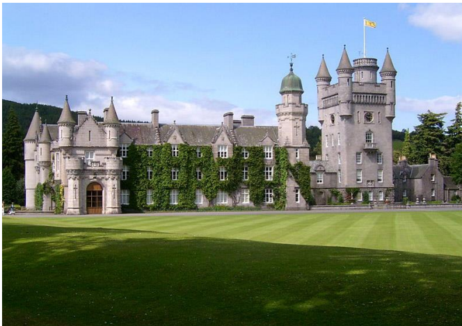
Balmoral Castle in Scotland