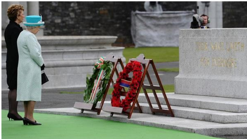
The Queen attends a memorial service