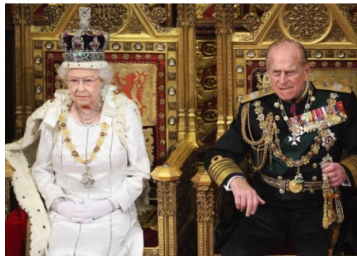
Sitting on her throne