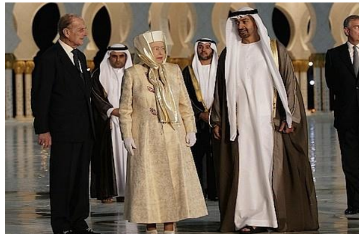
The Queen and the Duke of Edinburgh visit Dubai