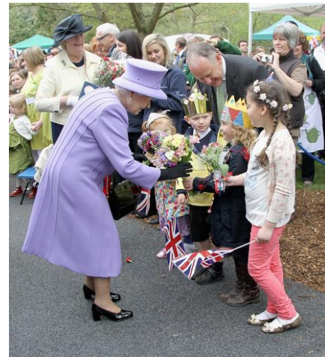
The Queen visiting the South West