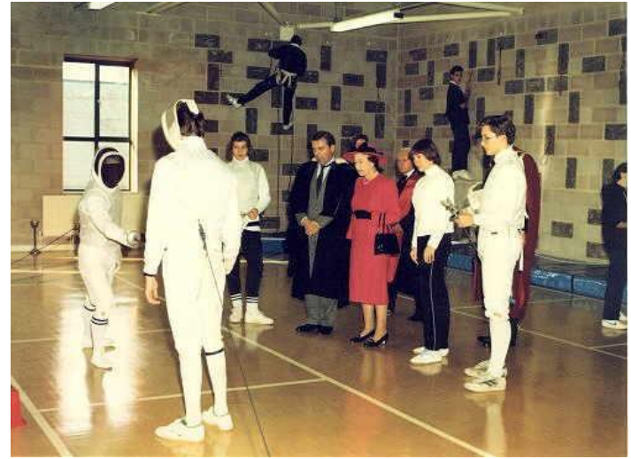
The Queen visiting Epsom College