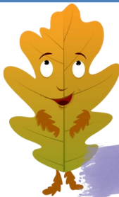
Goldie Respect for all