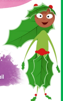
Holly Not afraid to fail