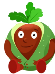
Casey Being happy, cared for and cared about