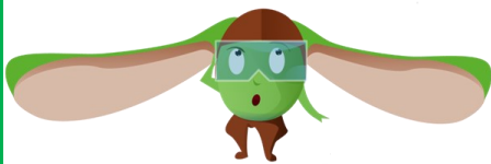
Solo Encouraging independence