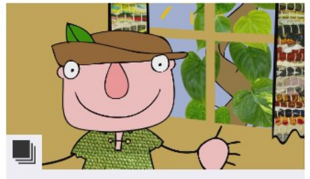
Jack and the Beanstalk

The story of Little Red Riding Hood told over the course of seven fun video clips.