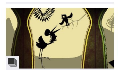
Tales From Around The World

Just some stories to view on: <a href="https://www.bbc.co.uk/teach/ksl-english/z67ncqt">https://www.bbc.co.uk/teach/ksl-english/z67ncqt</a>