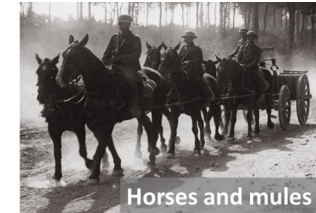
Horses and mules

During World War I, many animals had important jobs. Horses carried soldiers and their heavy things, like food and guns. Dogs helped find injured soldiers on the battlefields and delivered messages. Pigeons were like little messengers in the sky, carrying notes from one place to another. Cats and dogs made excellent companions for the soldiers and helped them feel less lonely. Elephants, camels, canaries and mice also helped the soldiers! These animals were heroes, just like the soldiers, and the parts they played were extremely important in helping the people fighting in the war.