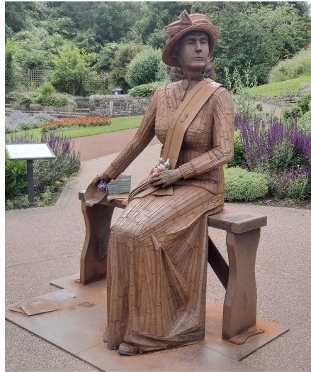
Memorial statue of Emily Davison in Morpeth, Northumberland, England.