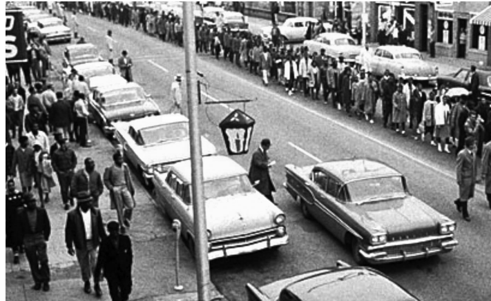
People walking to work during the Montgomery bus boycott